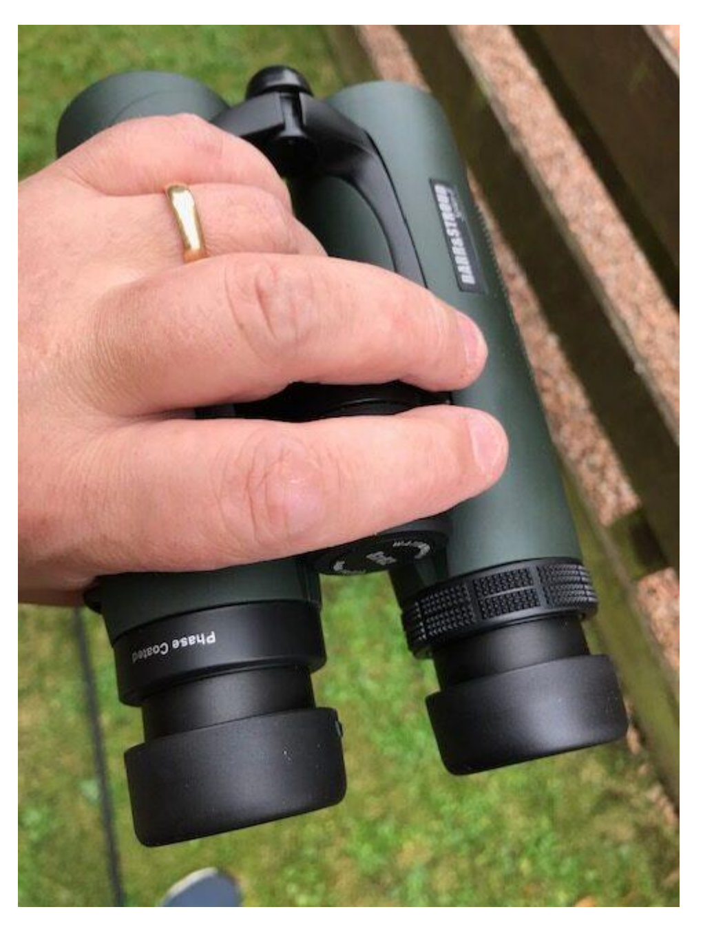
The open bridge design on the Series 8 affords real ergonomic advantages over the single bridge design, especially when using one hand.

In the hand, the instrument feels very solid and easy to handle. The focus wheel is a little on the stiff side, but moves very smoothly, with no backlash. I would describe the focuser on this Series 8 as being slow but very precise, taking about 2.25 revolutions to go from one end of its focus travel to the other. That would make the binocular more suited to hunting than birding. The dioptre ring is located under the right ocular, as most instruments in this price class are. It's quite large and easy to grip though, moving with just the right amount of tension to move it smoothly so that it stays rigidly in place.