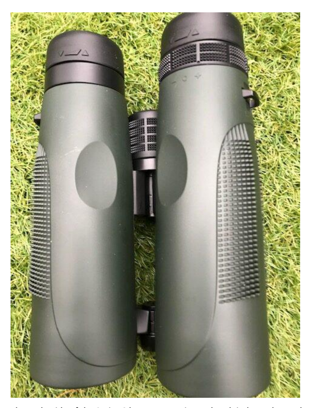
The underside of the Series 8 has two prominent thumb indents that make handling very natural and easy. Note the prominent ribbed armouring on the body which helps the user maintain a good grip while the binocular is in field use.

The eye cups consist of high-quality aluminium with a soft rubber overcoat that are very comfortable to rest your eyes on. They twist up in three stages and firmly lock in place when fully deployed, giving a very generous eye relief of 17.5mm, which renders them especially comfortable to use with eyeglasses. I elected to use them without glasses however, so kept them in their fully twisted out position throughout this review.