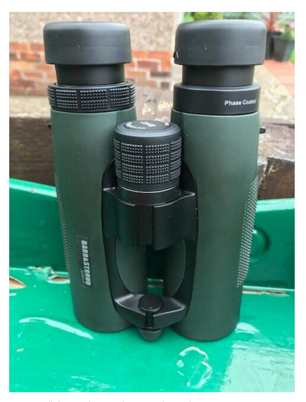
A very well designed, general-purpose binocular.

The Series 8 8 x 42 clearly represents great value for money, with optics that closely match its ergonomics. It's very easy to use and those who are fans of the open bridge design will very quickly take a shine to this instrument. Don't be put off by its non-ED labelling. This binocular shows just how good traditional crown & flint can be when properly executed. It does exactly what it says on the tin and makes for a very worthy addition to Barr & Stroud's line of high-performance binoculars. I would strongly recommend this to folk looking for a no-nonsense glass for the great outdoors and various astronomical excursions. The 10-year limited warranty offered by Barr & Stroud will also be honoured, as I can personally attest to.