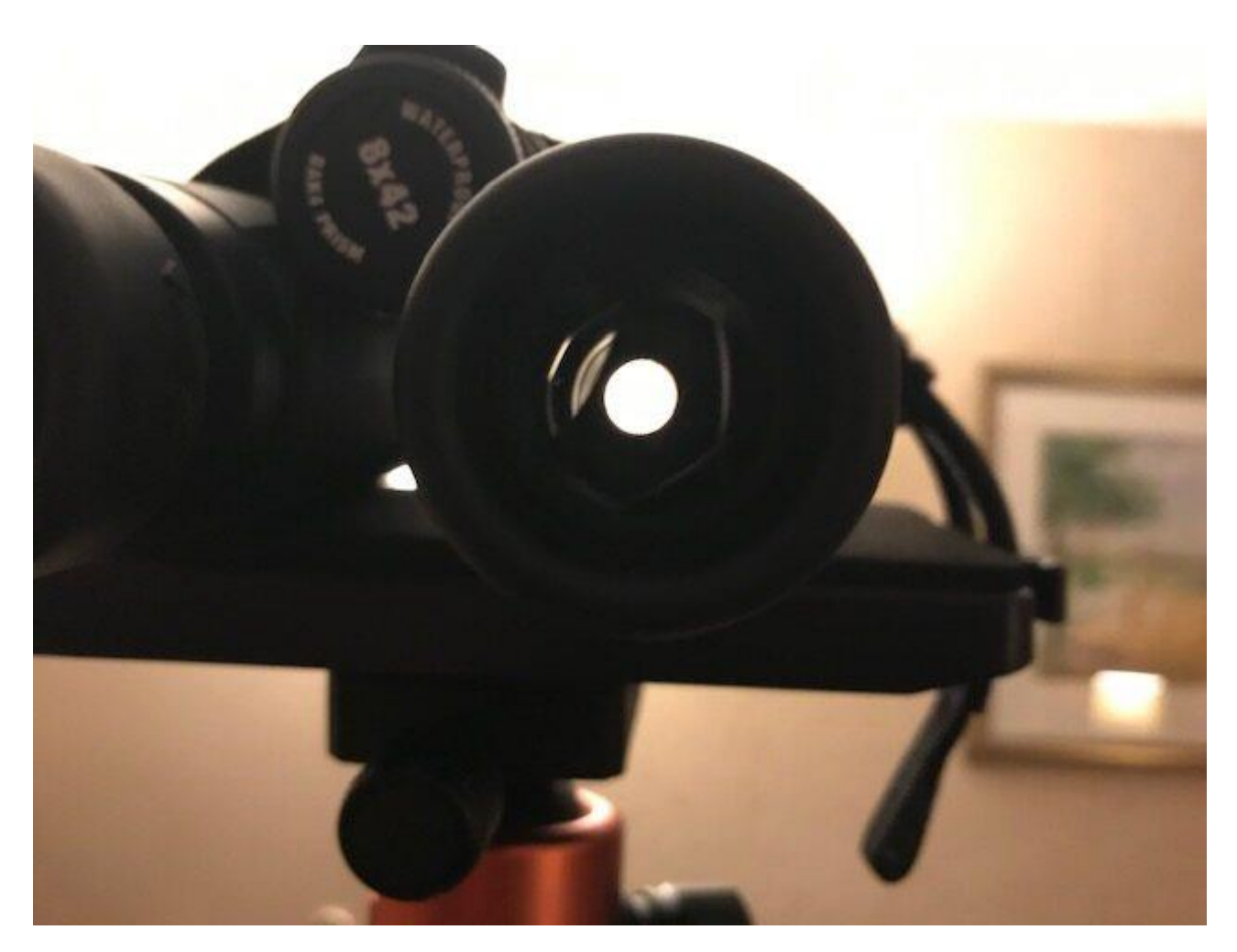
....and the right eye pupil.

As I initiated my daylight testing, I began to think about the reasons the Series 8 was significantly longer than the Series 5 models I had previously reviewed. In particular, I wondered whether there was a difference in focal length in going from the shorter Series 5 binoculars compared with the Series 8 models. I fired off an email to Barr & Stroud's parent company, Optical Vision Limited (OVL) asking for some information on this. I got an immediate response, stating that they would check with the optical engineers at their production site. A few days later, they sent me this response: