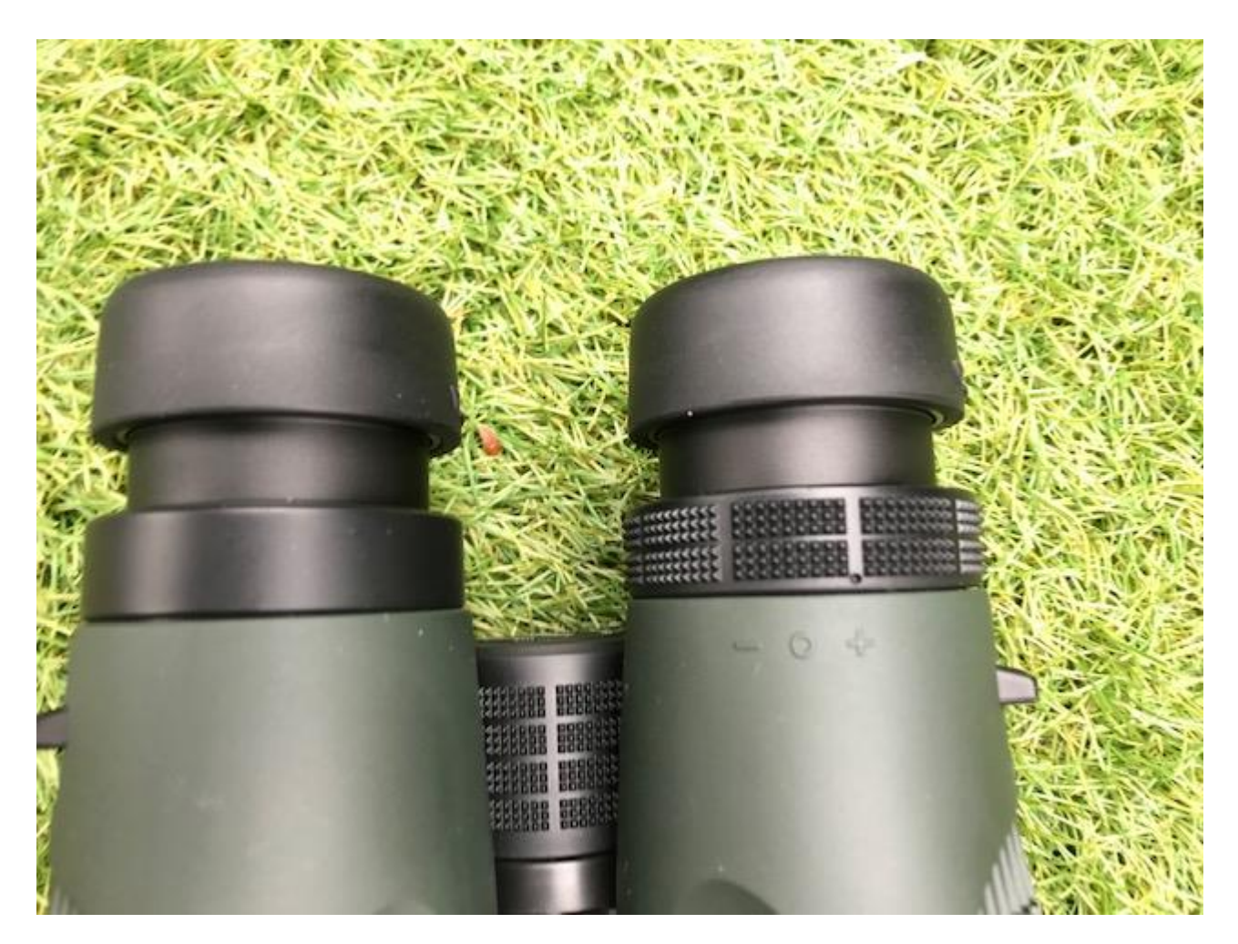
Note the long eye relief on the Series 8 ocular lenses which twist up using three intermediate positions to suit virtually all users.

The Series 8 was considerably lighter than I expected. Although the official specifications stated that it was nearly 800g, I measured its weight at just 716g; good news if you intend to do a lot of walking with this binocular.