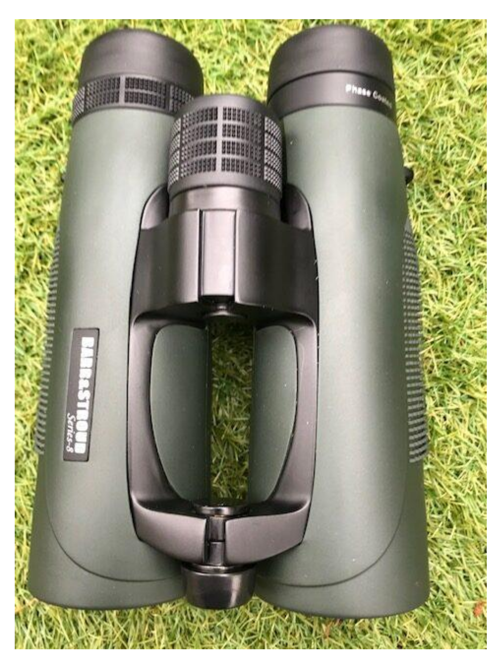
The Barr & Stroud Series 8 8 x 42 is a very solidly made instrument, with a very handsome fit and finish.